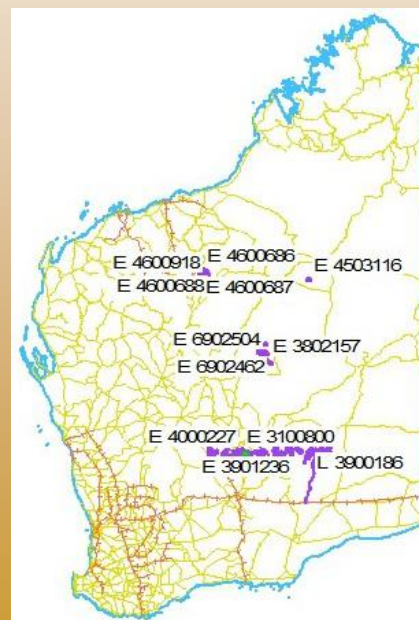
Tenements intersecting Areas of Interest