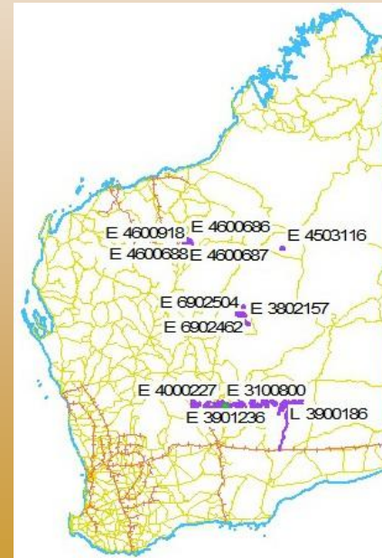
Tenements intersecting Areas of Interest